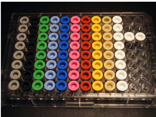
Micronic TPE Capclusters are available in 11 colors for easy sample distinction