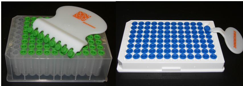
Micronic Manual Decappers allow you to easily remove a single TPE cap, or a row of 8 TPE caps at a time