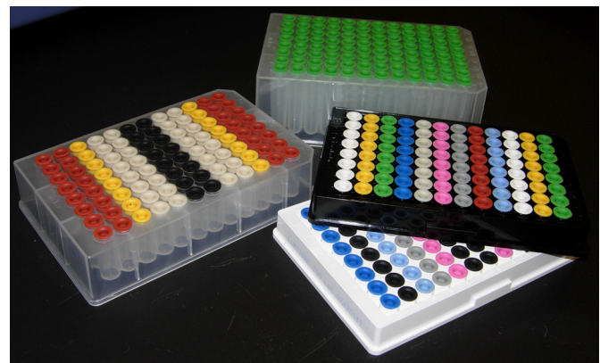
The Micronic capping range provides an excellent seal to Micronic racks, as well as to the wide assortment of Greiner Bio-One 96-well