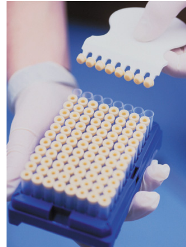
The Decapper-8 removes a row of 8 TPE caps in one motion