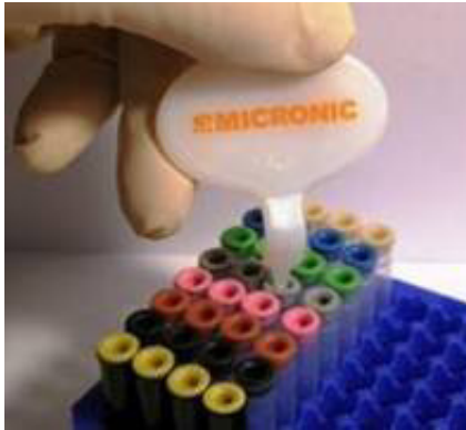
The Decapper-1 removes single TPE caps from racks of tubes quickly and easily

Designed for quick and easy removal of TPE Caps