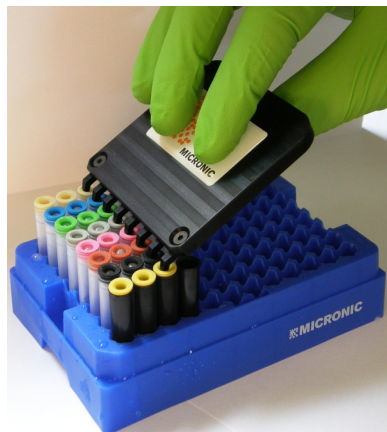
The Aluminum Decapper-8 was created after a customer requested a decapper sturdy enough to handle frozen tubes