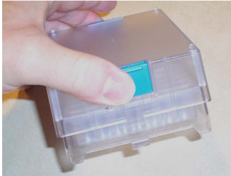
Press on the tabs to release the lid

Micronic polycarbonate ComoRack-96 and ComoRack-24 racks are now available with easy-to-remove polycarbonate lids. Just press on the tabs at each end to quickly release the lid locks. The dimensions of the new lid are the same as the old lid, and lids can be purchased separately for use with the original Micronic polycarbonate racks.